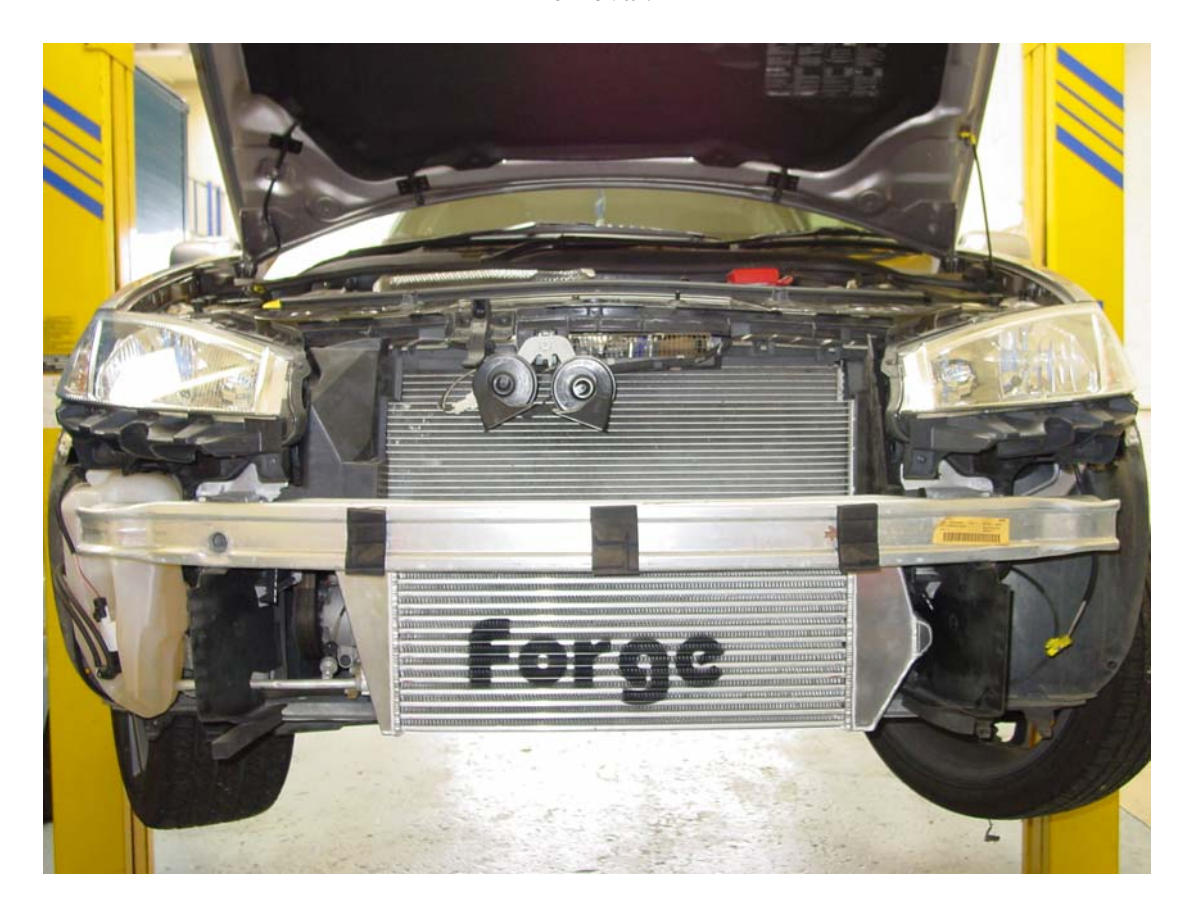
Engineered for performance.

3/ Now fit the uprated intercooler in to place. Refit and tighten the 2 hose connections. You will now need to cut the plastic air diverters to suit the new intercooler shape; this can be done with a suitable sharp craft knife, hot knife or hacksaw. You can now refit the crash bar and complete bumper section in reversal of removal.